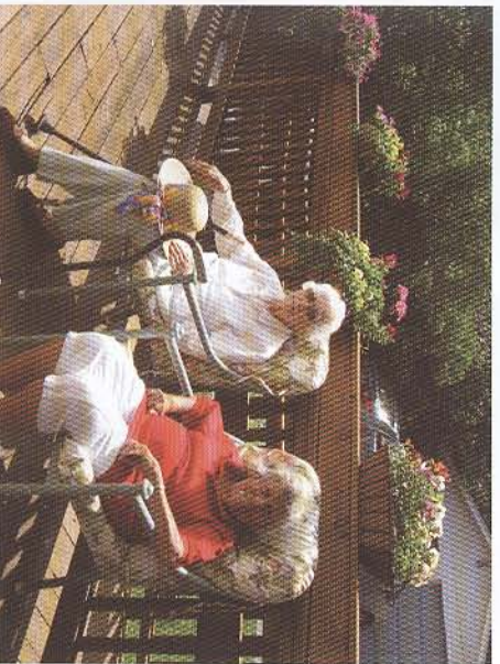
Residents love to sun themselves on our beautiful patio deck.

Monthly fees are based on the type of room and the level of care needed.